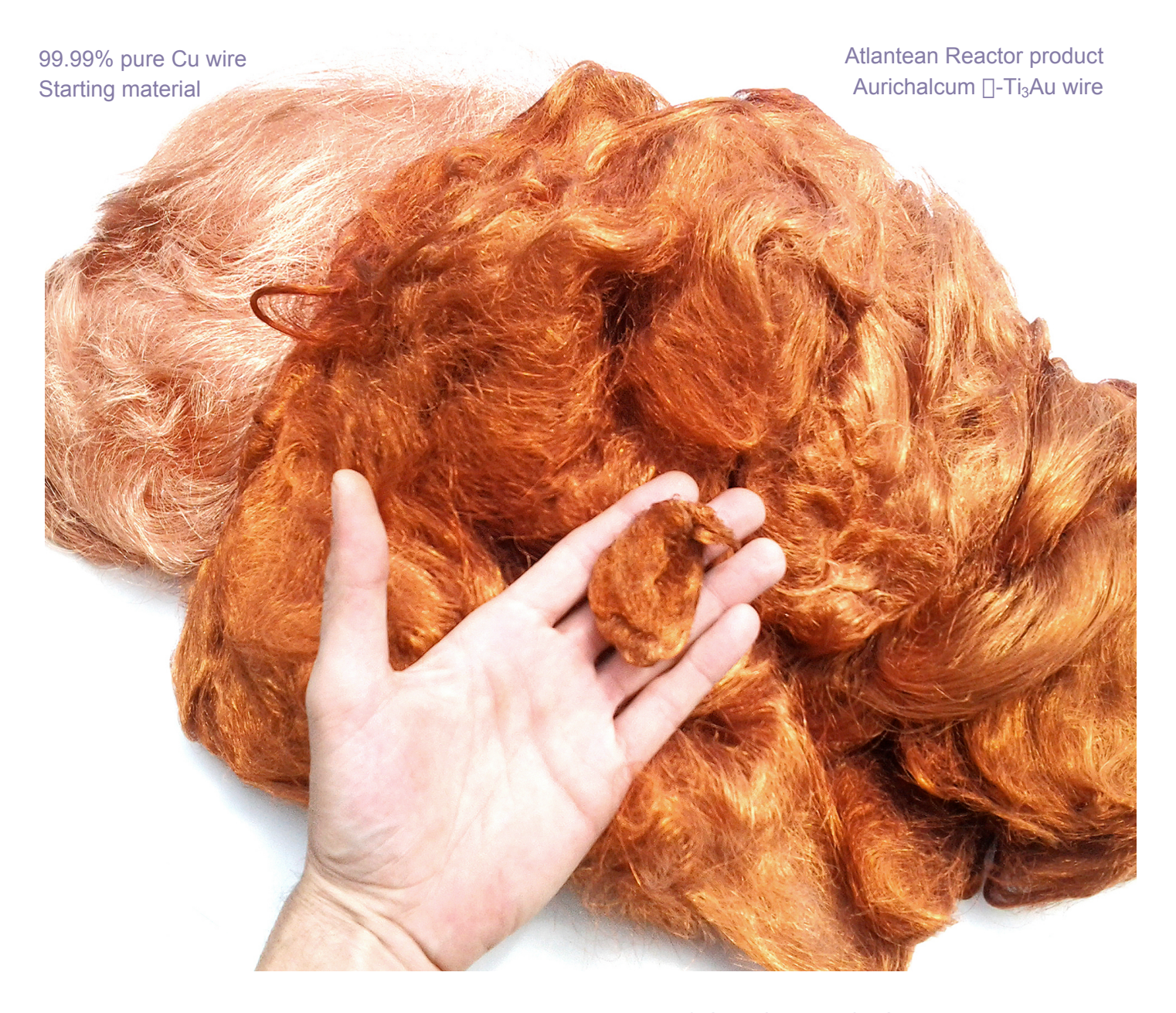
Atlantean Aurichalcum Reactor Products & Specifications for Sale Alexander Putney for Human-Resonance.org - July 13, 2019

Alexander Putney's breakthrough invention of the Atlantean Aurichalcum Reactor enables resonant atomic transmutation of several pounds of 99.99% pure copper starting material into >95% aurichalcum (technically classified as \alpha -Ti<sub>3</sub>Au intermetallic compound) in just a few weeks of operation at low temperatures.