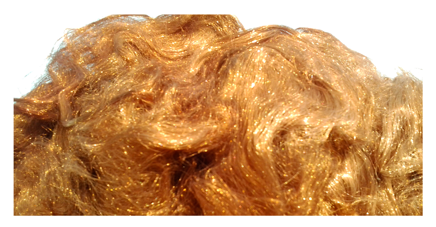
Upon melting pure Ti_3 Au aurichalcum, the intermixed gold and titanium components readily separate into 57.8% gold and 42.2% titanium by weight, due to the significant atomic mass disparity between the two elements. Standard gold refining methods can be used to separate the 57.8% gold content from the titanium matrix to obtain 99.9% pure gold if desired.