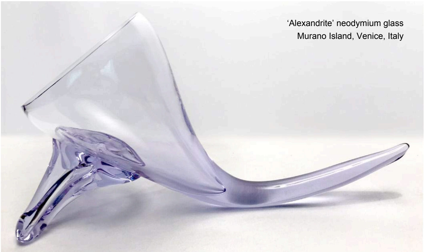
'Alexandrite' neodymium glass Murano Island, Venice, Italy