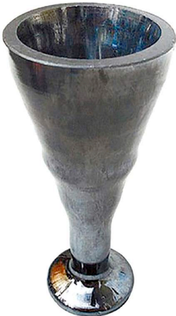
Drinking vessel, 90% silicon alloy Tunguska, Krasnoyarsk, Russia