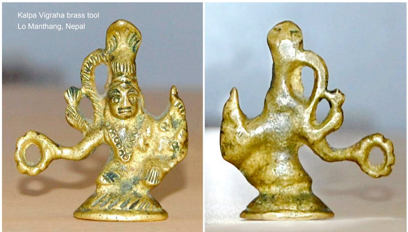
Kalpa Vighraha brass tool Lo Manthang, Nepal

They concluded that the language belonged to the proto-historic period of Hinduism when it was thought no language existed and that the Vedas were being passed down orally... The manuscript mentioned the name of the idol –'kalpa maha-ayusham rasayana vighraha' abbreviated in CIA files to 'Kalpa Vighraha'.