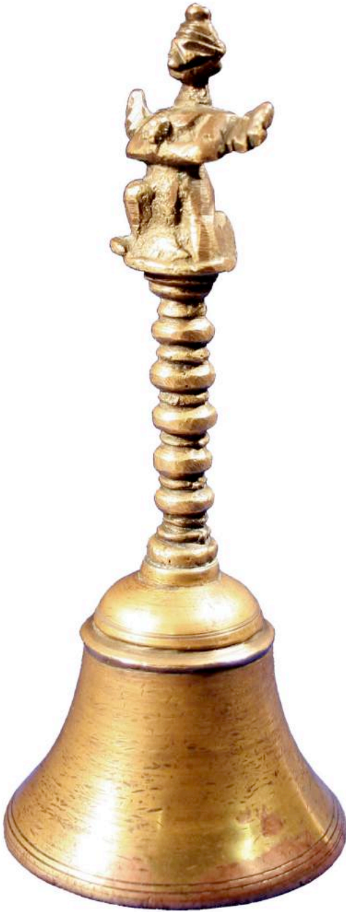
Garuda bell, resonant brass tool Buckhannon, West Virginia, US