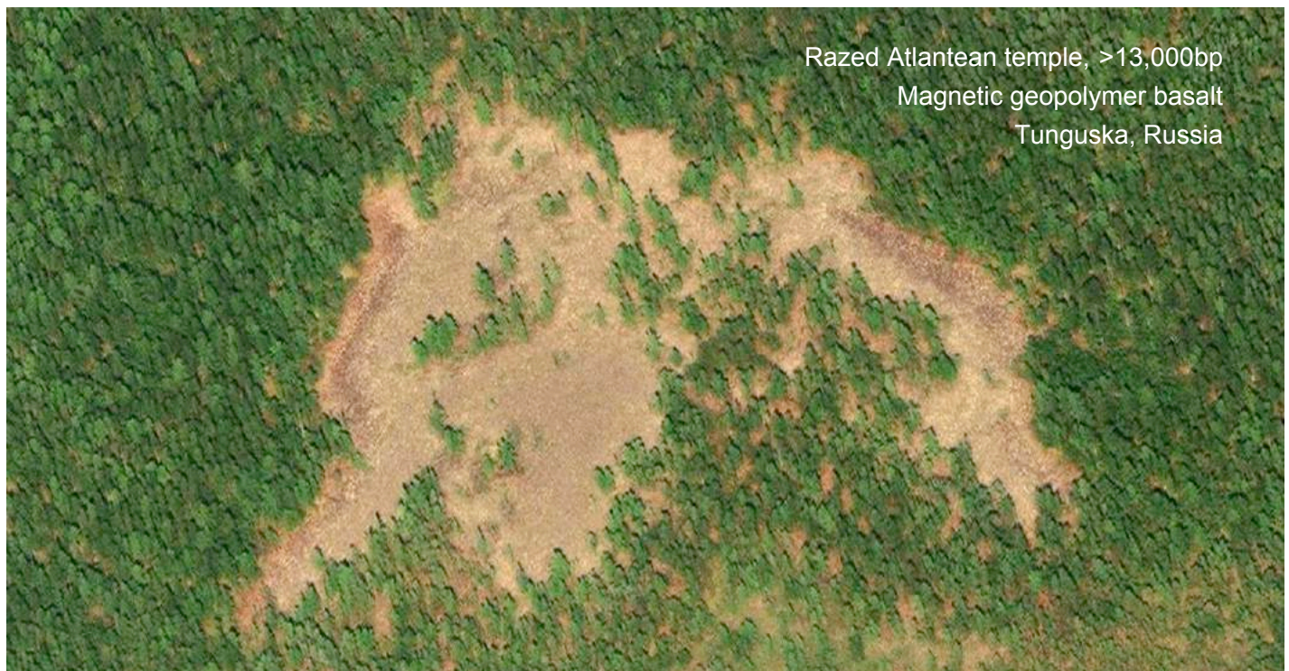
Razed Atlantean temple, >13,000bp Magnetic geopolymer basalt Tunguska, Russia

According to implications made by Kabanov himself, the resonant silicon alloy drinking vessel may have been recovered in conjunction with UFO activity transiting to and from a nearby underground base. The small scale of the vessel suggests it was made by Atlantean hobbits still residing below an elevated boulder field 2 miles east of the Tunguska explosion site –where no trees grow due to strong EM fields (below).