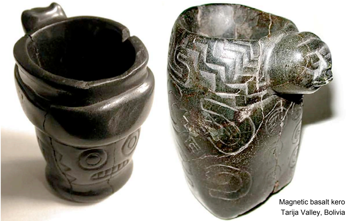
Magnetic basalt kero Tarija Valley, Bolivia